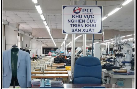
Photo6: Sample Room overall