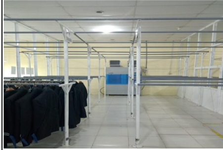
Photo11: Drying room section overall