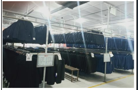
Photo12: Finish Good Warehouse