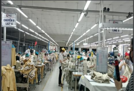
Photo7: Sewing section overall