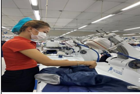
Photo8: Ironing section overall