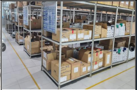
Photo3: Accessories warehouse overall