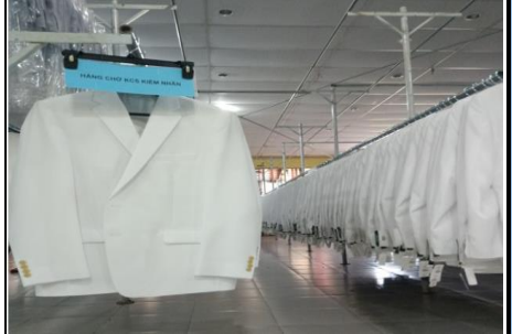
Photo9: Packing section overall