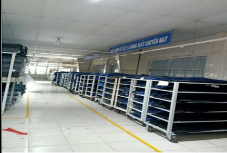
Photo4: Relaxing section overall