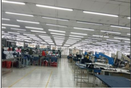
Photo5: Cutting section overall