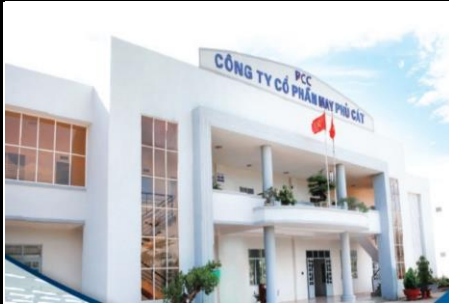
Photo1: Main Gate