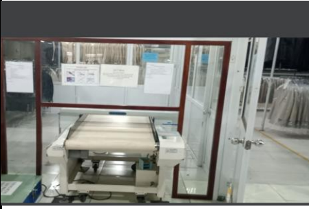
Photo10: Needle detector overall