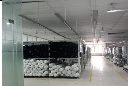
Photo2: Fabric warehouse overall